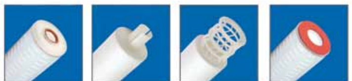
213 (internal o-ring) PP Core Ext. Spring DOE (double open end)

Note: This publication is to be used as a guide. The data within has been obtained from many sources and is considered to be accurate. Harmsco does not assume liability for the accuracy and/or completeness of this data. Changes to the data can be made without notification. Temperature, Pressure, Flow Rates, Differential Pressures, Chemical Combinations and other unknown factors can affect performance in unknown ways. Limited Warranty: Harmsco warrants their products to be free of material and workmanship defects. Determination of suitability of Harmsco products for uses and applications contemplated by Buyer shall be the sole responsibility of Buyer. The end user/installer/buyer shall be liable for the product's performance and suitability regarding their specific intended applications. End users should perform their own tests to determine suitability for each application.