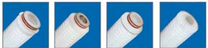
226 222 (w/SS insert) 222 Flat Cap