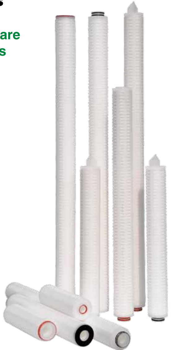
Pleated Polypropylene Cartridges